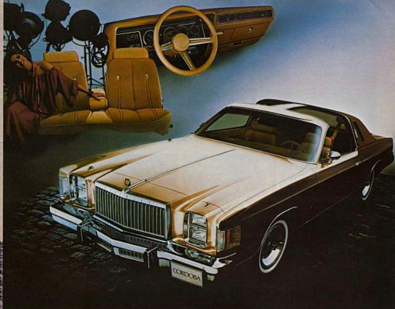
Chrysler Cordoba with Optional Two-Tone Paint and T-Bar Roof

A passenger's car, too. Cordoba interiors spell comfort and pleasure.