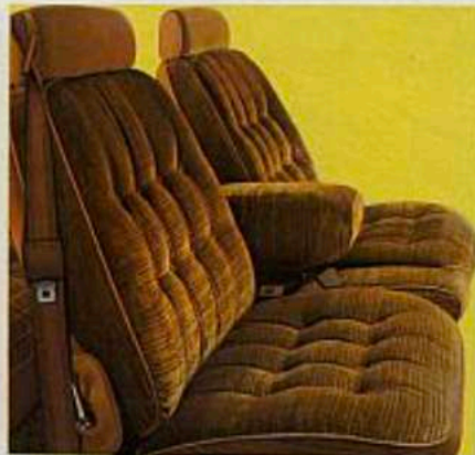
Optional Cloth 60/40 Bench Seats

Discover or rediscover the joy of driving . . . in a '79 Chrysler Cordoba . . . the driver's car. It's a luxurious personal car. There's more to the Cordoba experience. There's responsiveness, quiet, and comfort. Cordoba is an uncommon car at a time when cars are tending to become more alike.