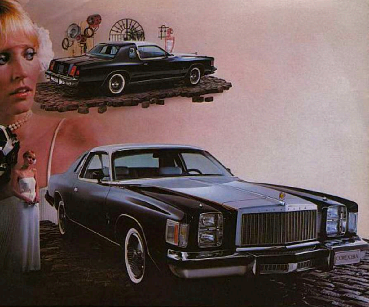
Chrysler Cordoba with Optional Special Appearance Package