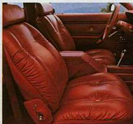
Optional Leather-and-Vinyl Bucket Seats

Cordoba's instrument panel gives you the best of both worlds. Modular construction for easy servicing balanced with the styling of walnut-like inserts. Controls are within comfortable reach. Gauges feature quick read-out. It's easy on the eyes and lets you know what's going on.