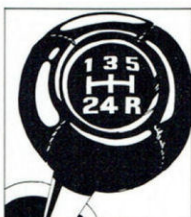
5 speed overdrive for extra highway economy.