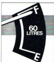
60 litre fuel tank. Longer hauls between refills.