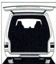
High, wide rear access with rear step, for really tall cargo.