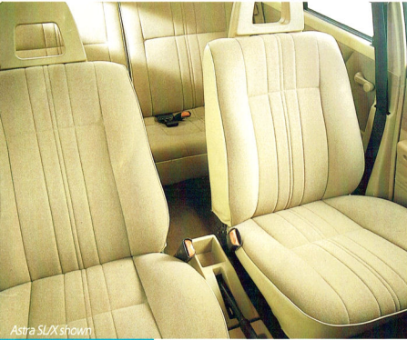
Astra SLX shown

This is now a car that has all the advantages of the hatchback in a much more civilised form. The Holden Astra is for people who want the convenience of a five door hatch but who appreciate a higher level of comfort and refinement.