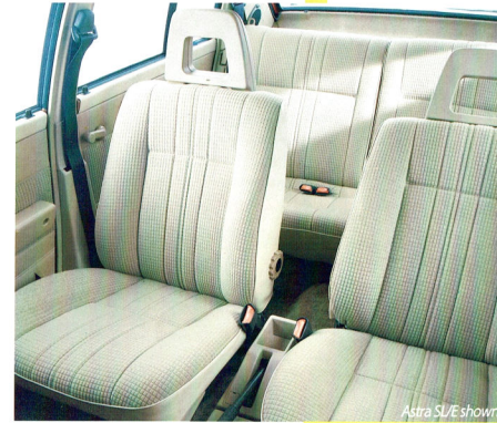
Astra SLE shown