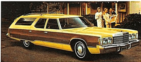
Chrysler Town & Country Wagon