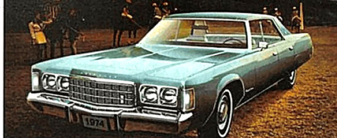
Newport Custom 4-Door Hardtop

There's a lot more to the Chrysler value, convenience, comfort and luxury story. Drive one and learn for yourself the difference that extra care in engineering makes. You'll appreciate it!