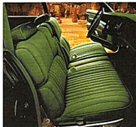
Standard Trim—N.Y. Brougham