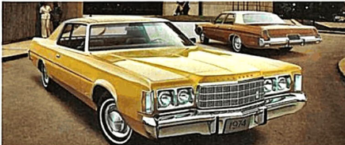
Newport 2-Door Hardtop and 4-Door Sedan