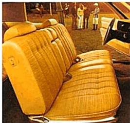
Standard Trim—Newport Custom