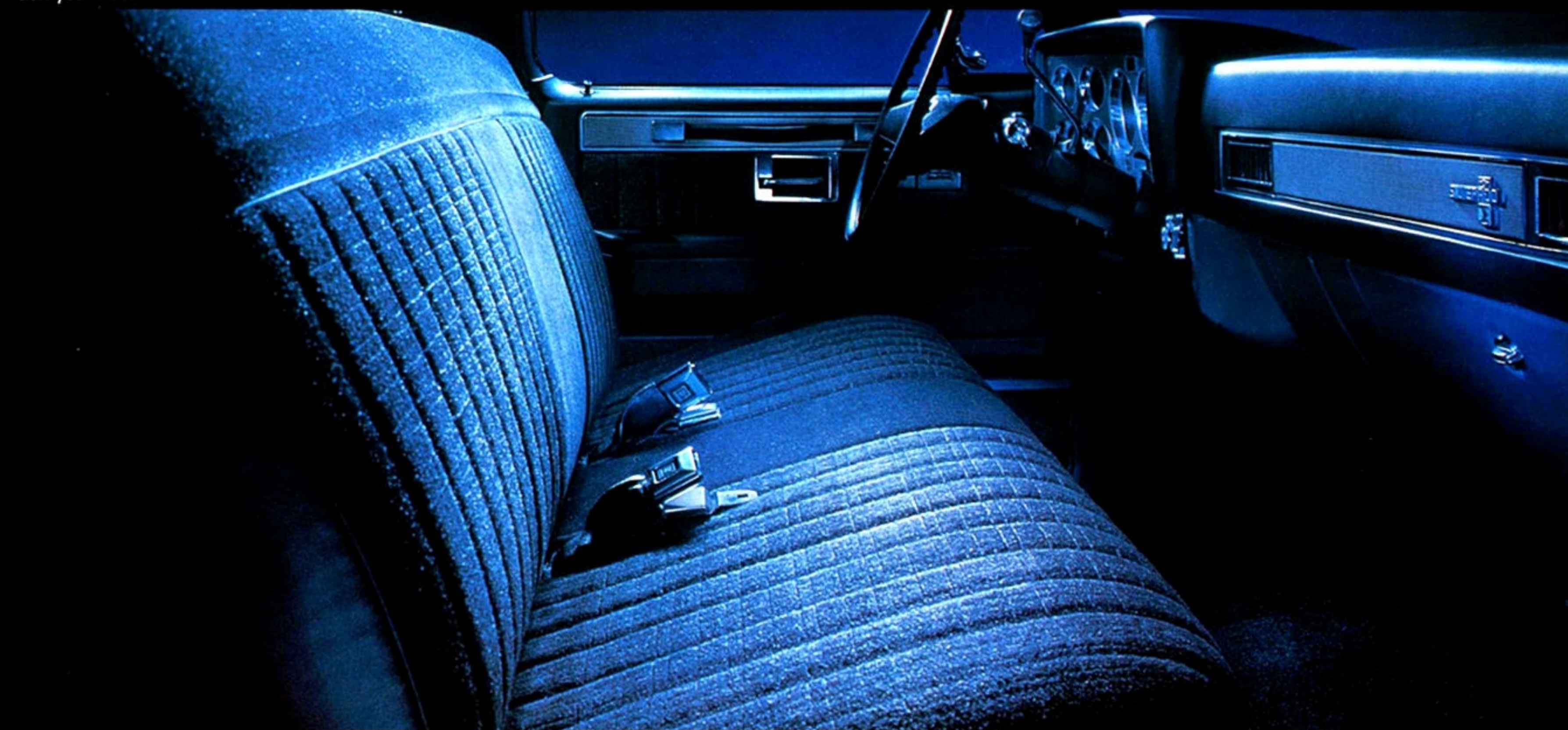
Silverado interior with Blue Custom Cloth.

Note: Oil pressure and temperature gauges shown are metric in Canada.