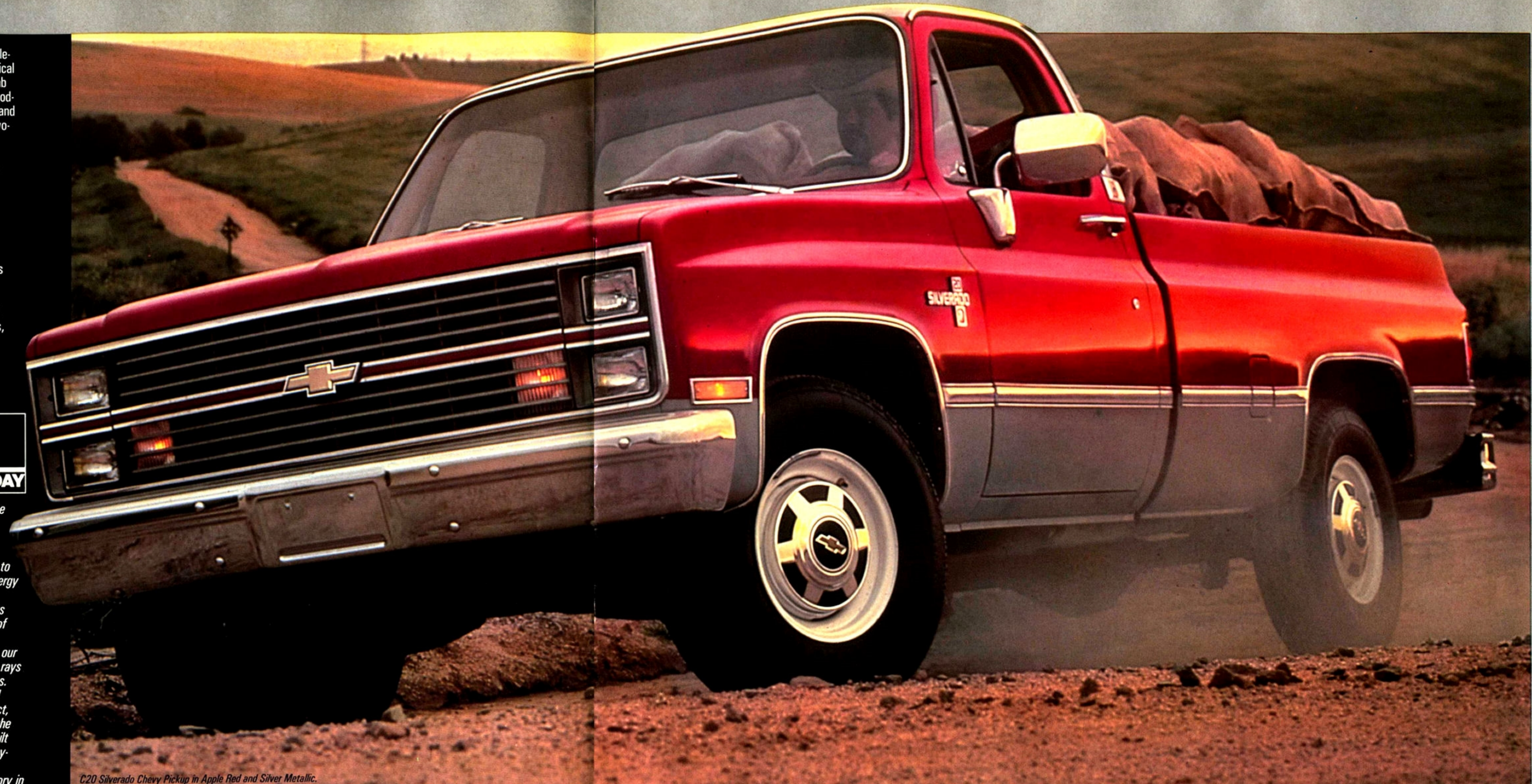
C20 Silverado Chevy Pickup in Apple Red and Silver Metallic.

See your dealer for information about GM's 24-month/40,000 km Powertrain Limited Warranty. For diesel engines this limited warranty is 36 months/80,000 kms. Powertrain coverage is subject to a deductible per repair visit after the first 12 months/20,000 kms.