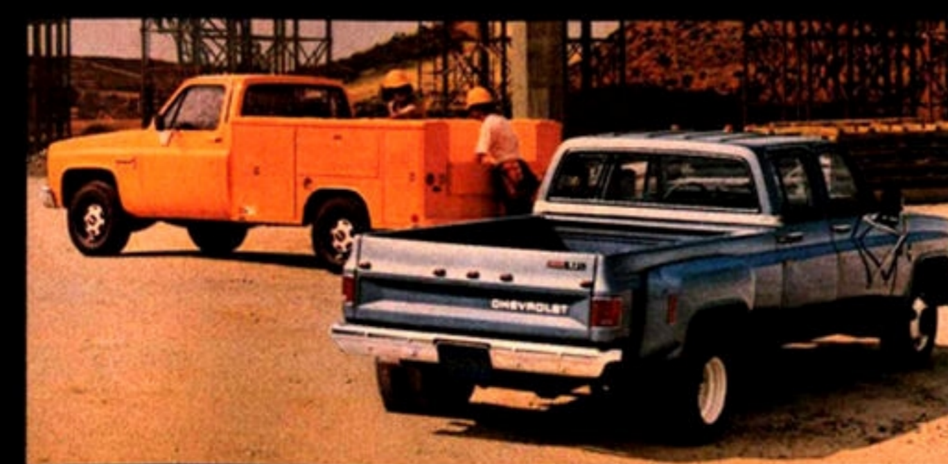
CREW CAB/BONUS CAB. Crew Cab with front and rear bench seats shown in Lt. Blue Metallic. Bonus Cab (not shown) has no rear seat for 55.8 cu. ft. of lockable storage space. Also shown in C30 Chassis-Cab in Colonial Yellow.