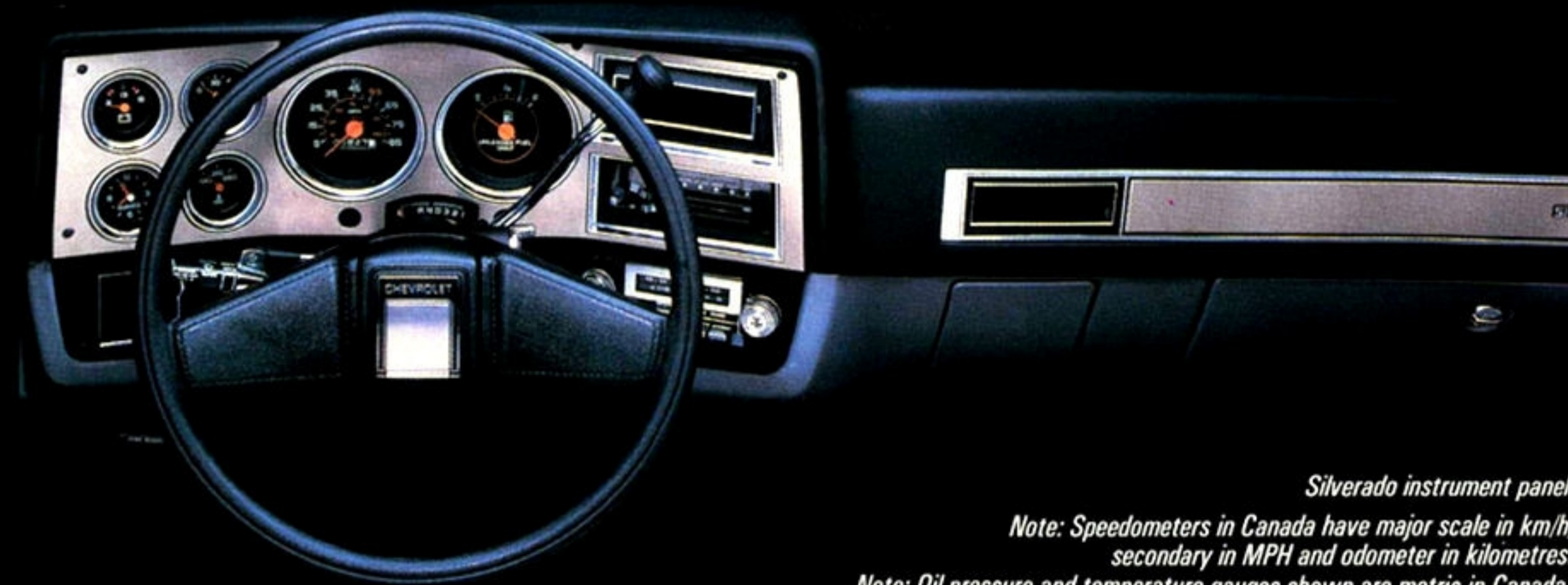
Silverado instrument panel.

Chevy offers three available trim levels: the standard Custom Deluxe, the up-level Scottsdale and the top of the line Silverado. Make your own choice, comfort, convenience and style keynote are common factors in any selection you make.