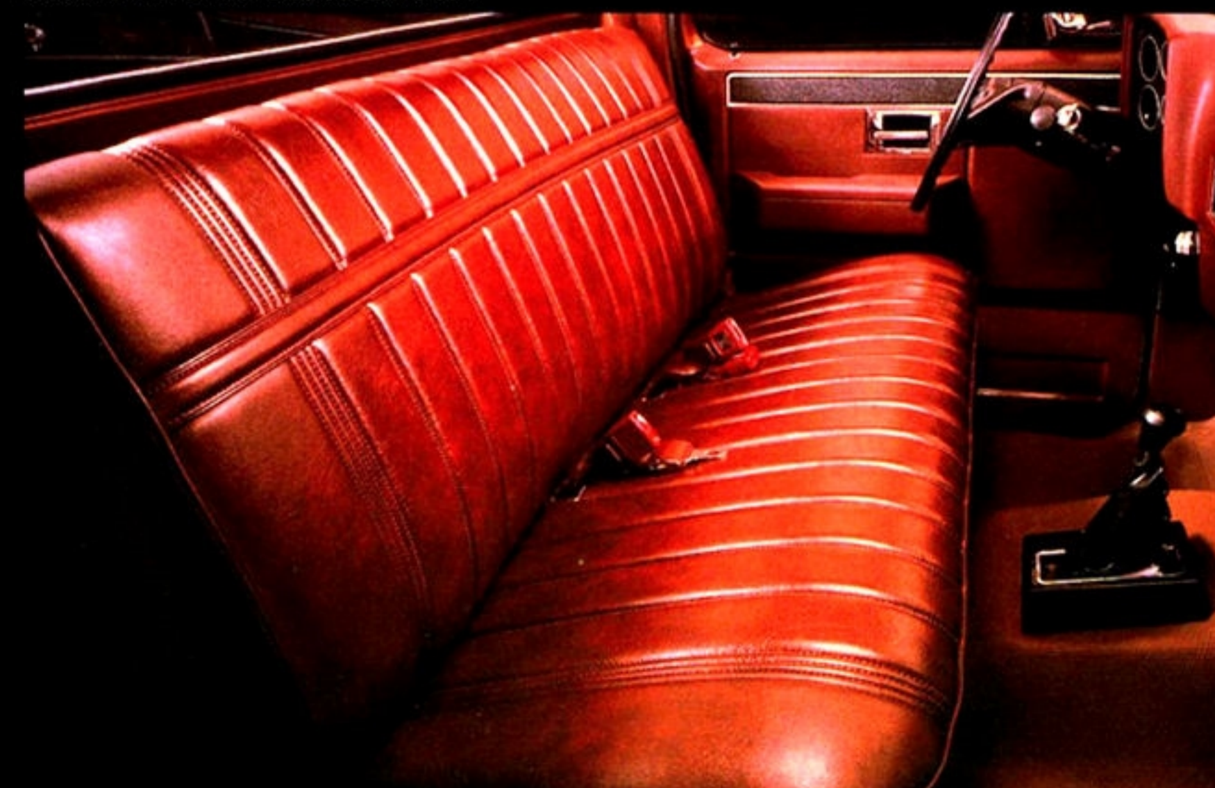
Optional Scottsdale interior with Mahogany Custom Vinyl.