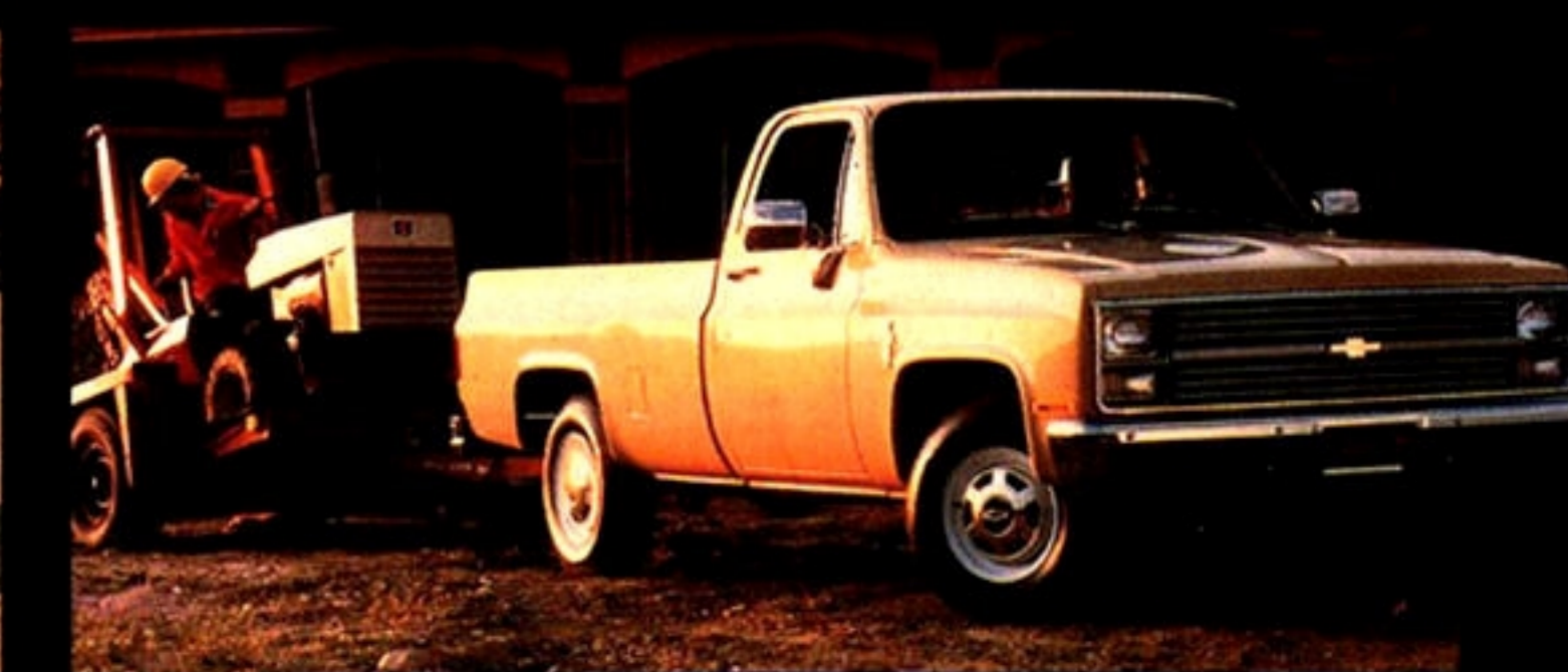
FLEETSIDE, SHORT AND LONG BOX. 6 1/2-ft. short box or 8-ft. long box available in three series. Shown here is the long-box C20 Diesel in Doeskin Tan.