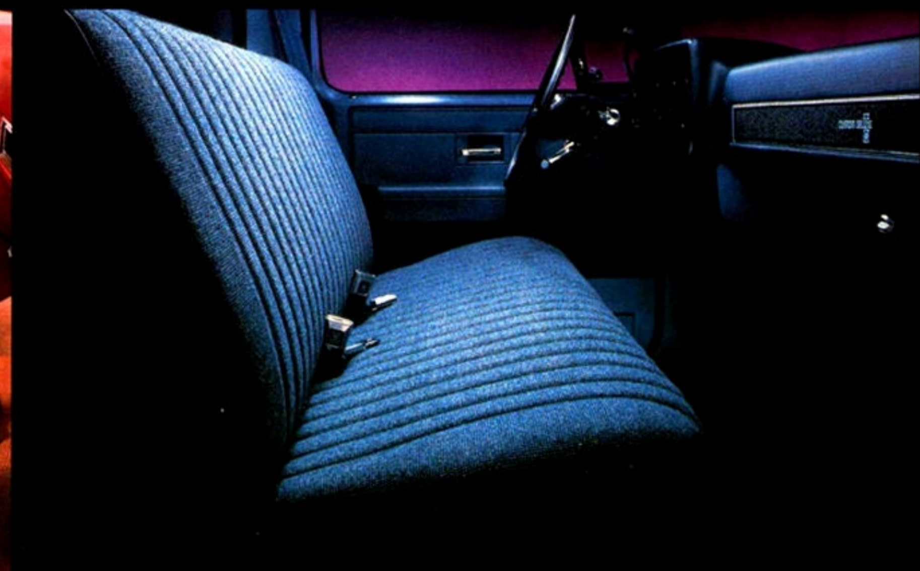
Std. interior with Deluxe Blue Cloth.