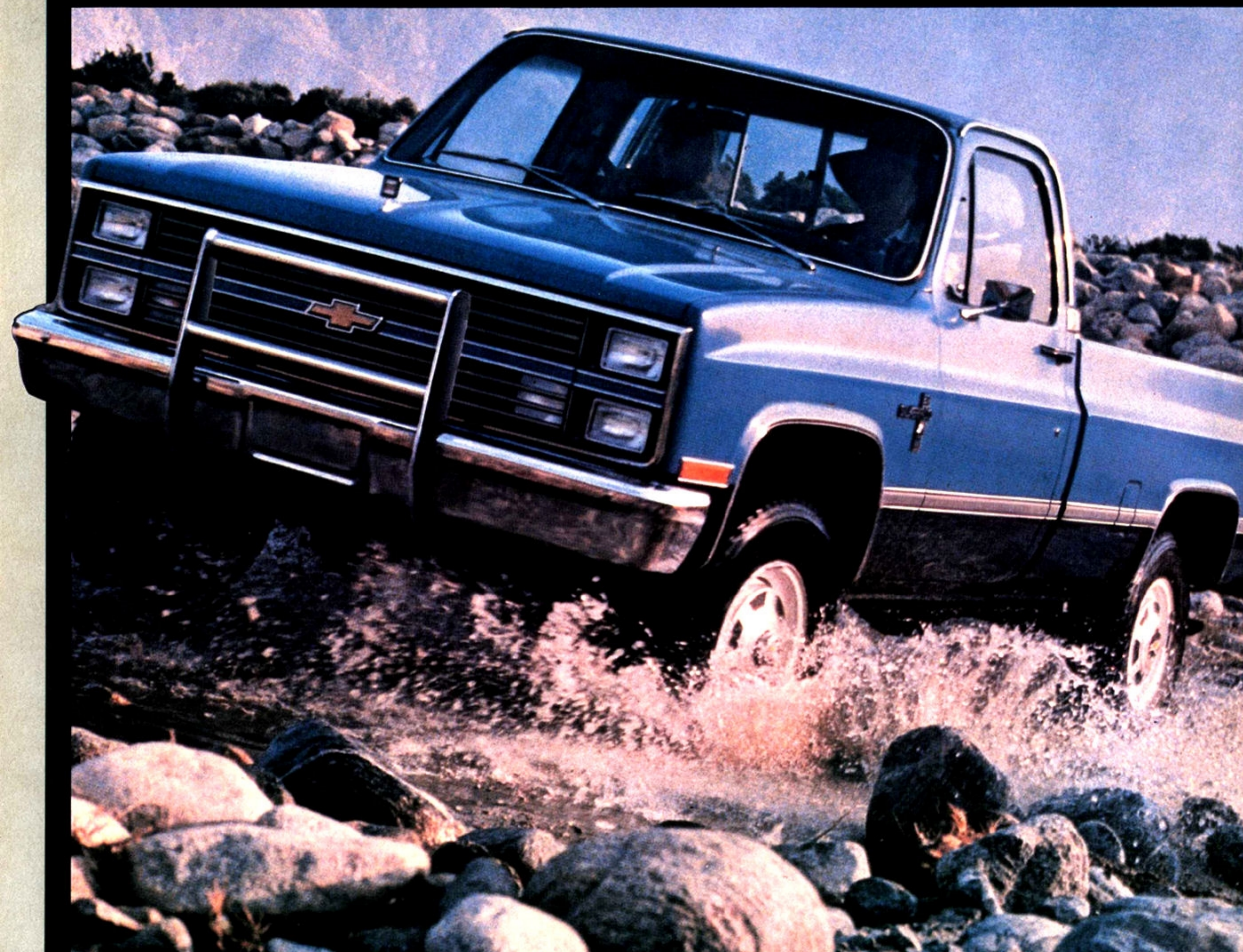
K20 Diesel Fleetside Chevy Pickup in Lt. Blue Metallic and Midnight Blue.