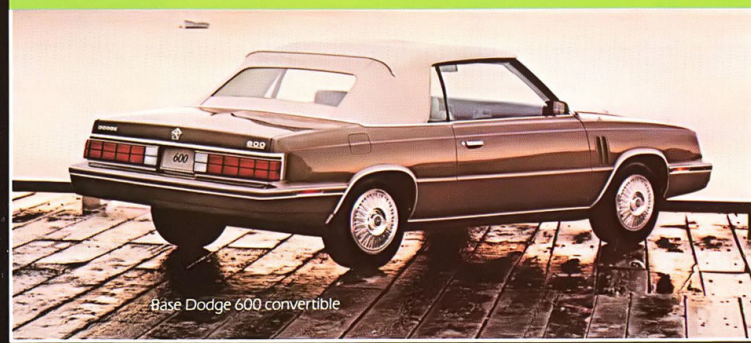
Base Dodge 600 convertible

Get it all out in the open, and move it with turbocharging and electronic fuel injection! This front-wheel drive beauty does it in style, with leather, electronic instrumentation and power assists!