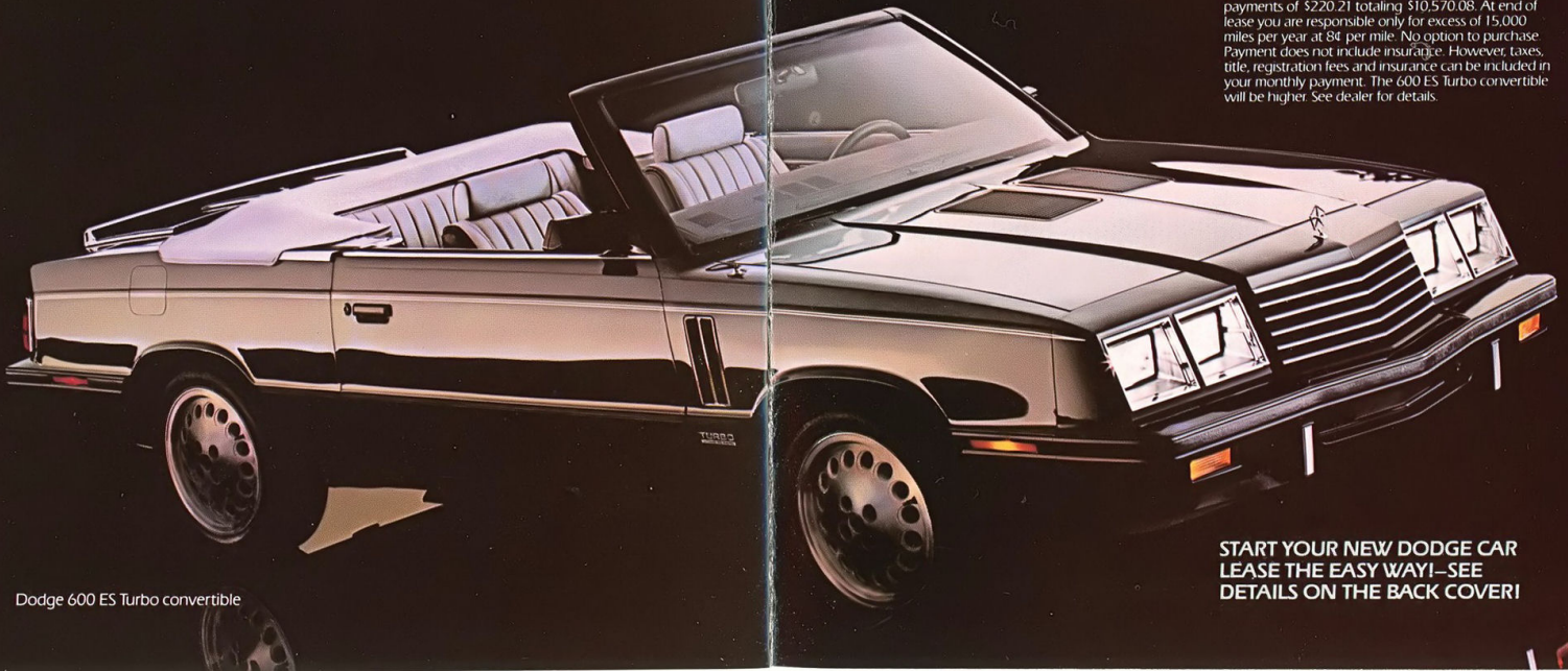
Dodge 600 ES Turbo convertible

*Monthly payment based on Manufacturer's Suggested List Price. Taxes, title and registration fees not included. NO DOWN PAYMENT . Refundable security deposit of $225.00, and $220.21 first month's payment in advance required. Total of 48 monthly payments of $220.21 totaling $10,570.08. At end of lease you are responsible only for excess of 15,000 miles per year at 84 per mile. No option to purchase. Payment does not include insurance. However, taxes, title, registration fees and insurance can be included in your monthly payment. The 600 ES Turbo convertible will be higher. See dealer for details.