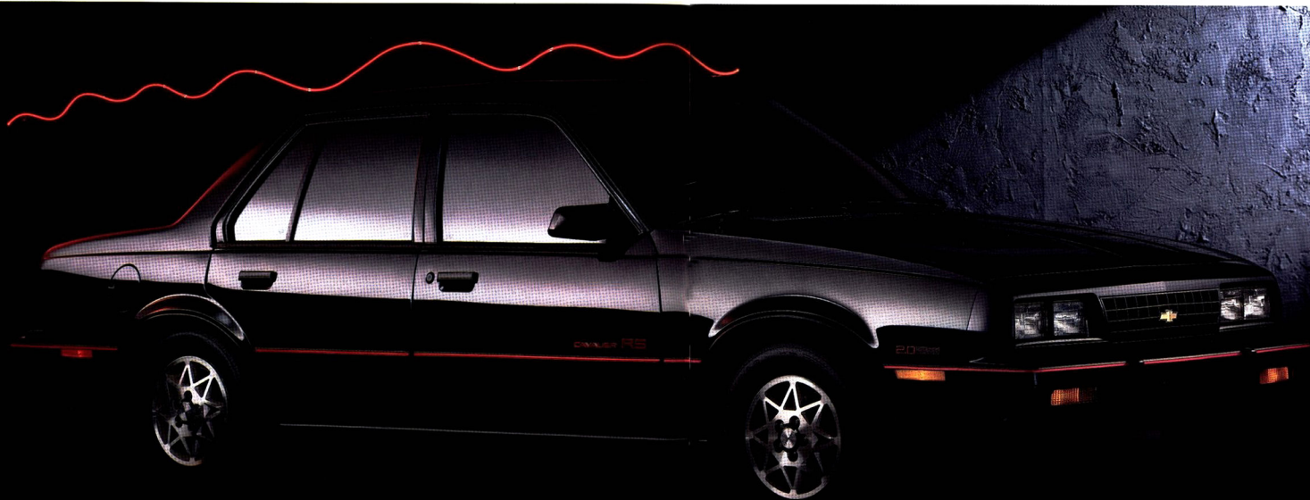
Cavalier RS Sedan.