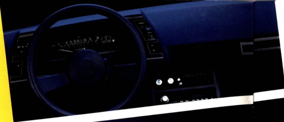
RS Coupe instrument panel. Cavalier RS Coupe.