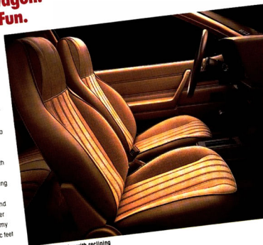
CS Wagon interior with reclining front bucket seats and available cloth trim.

Now, match that with Cavalier's standard, fully reclining front buckets and available cloth trim. And the best thing about them is they're all Cavaliers.