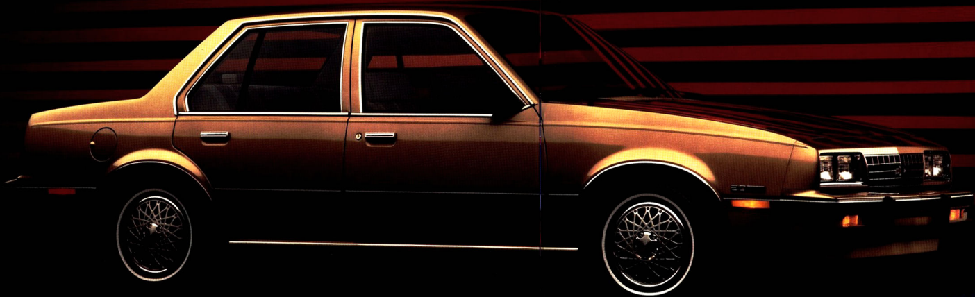
Cavalier CS Sedan.