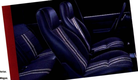
RS Wagon interior. Cavalier RS Wagon.