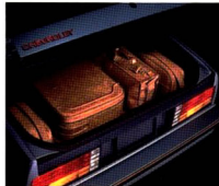
RS Coupe's vacation-sized trunk offers 13.2 cubic feet of load space.