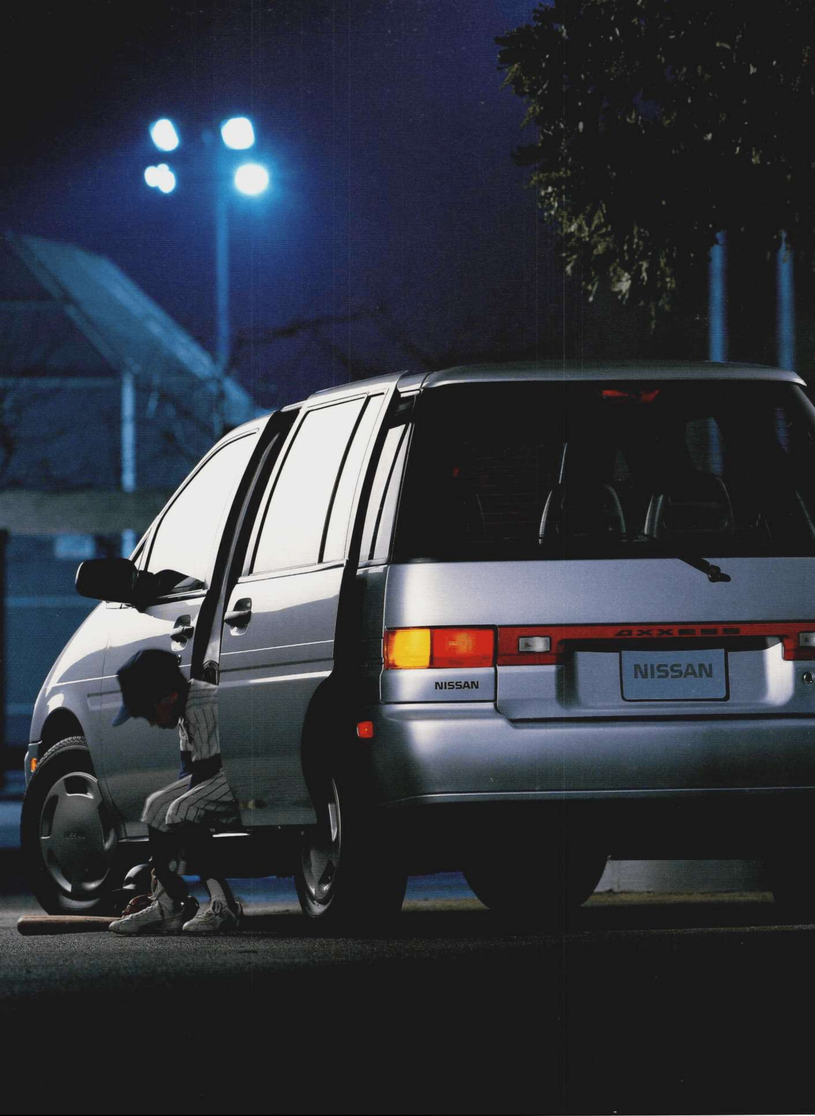
Axxess SportWagon Front-Wheel Drive XE shown here in Winter Blue/Silver Frost and on cover in Silver Frost.