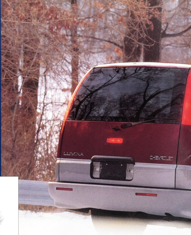
Lumina Van, shown with available two-tone paint in Medium Garnet Red Metallic over Light Gray Metallic.

Lumina Van's high-strength steel spaceframe construction makes it an exceptionally rigid and durable vehicle. The ladder-type frame features full-length rails with cross-members for a stiff overall structure.