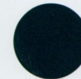
Oceanus Pearl 2 with Ivory or Dark Stone interior