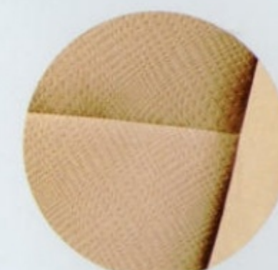
SE/SLE fabric in Dark Stone or Ivory (shown)