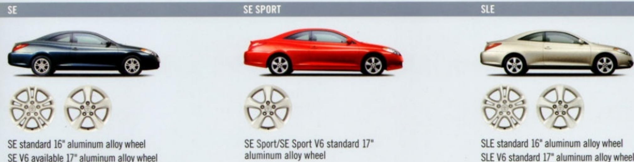
SE standard 16" aluminum alloy wheel SE V6 available 17" aluminum alloy wheel