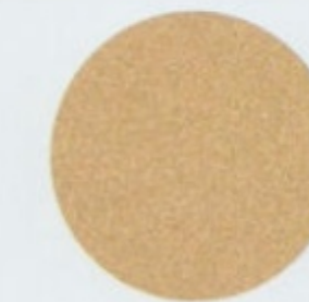
Desert Sand Mica 2 with Ivory interior