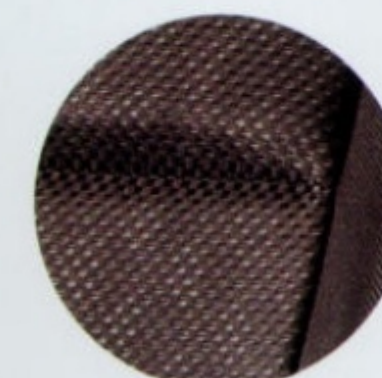
SE Sport fabric in Dark Charcoal