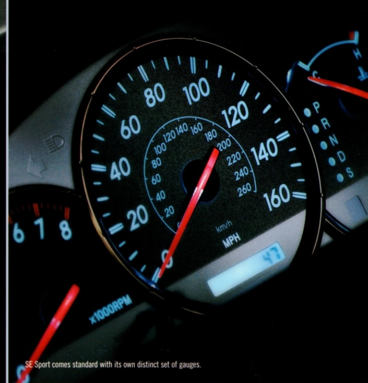
SE Sport comes standard with its own distinct set of gauges.