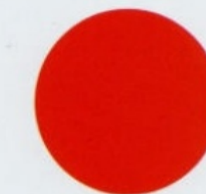
Absolutely Red with Ivory, Dark Stone (SE, SLE) or Dark Charcoal (SE Sport) interior