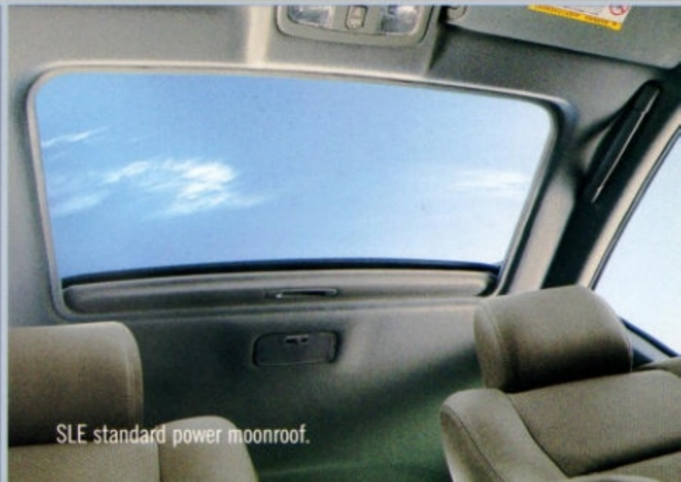
SLE standard power moonroof.