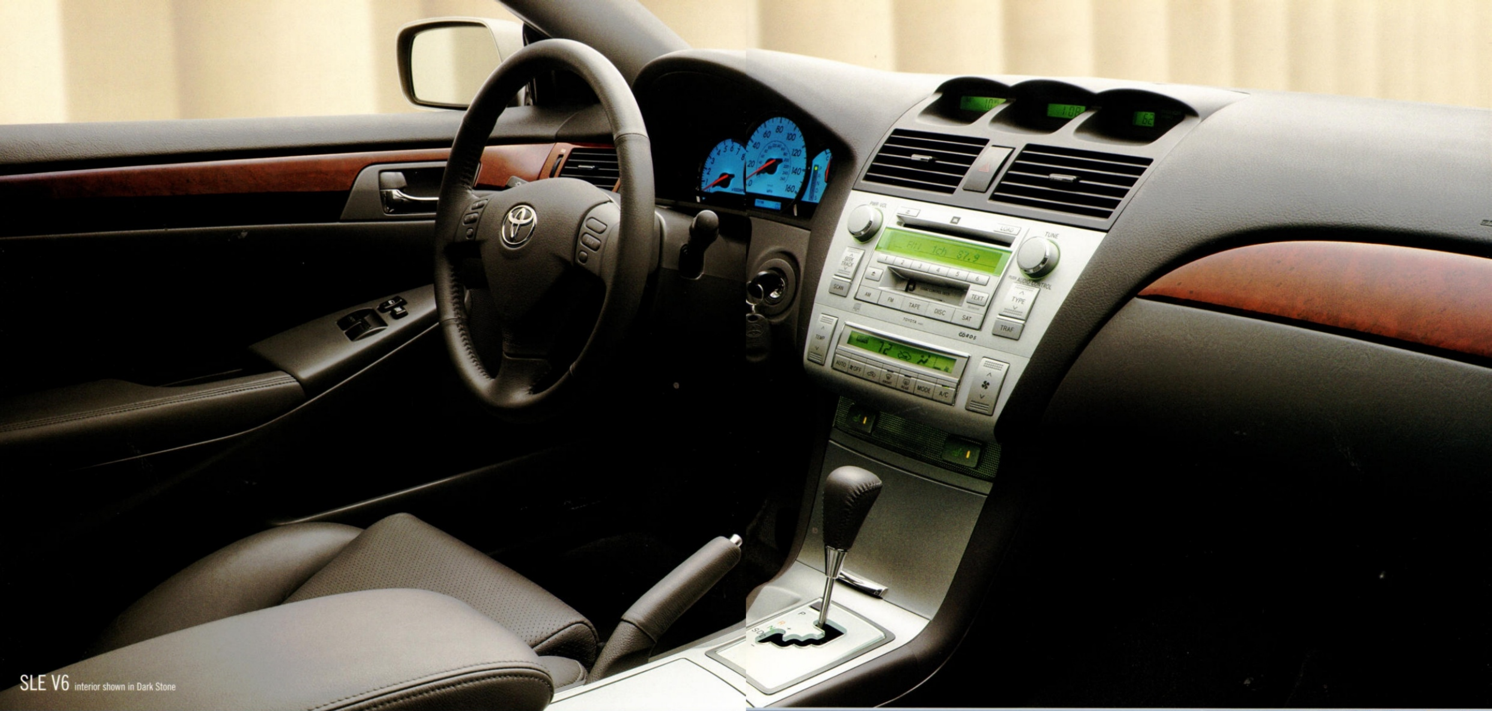
SLE V6 interior shown in Dark Stone