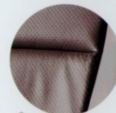
SLE Leather Trim 1 in Ivory or Dark Stone (shown)