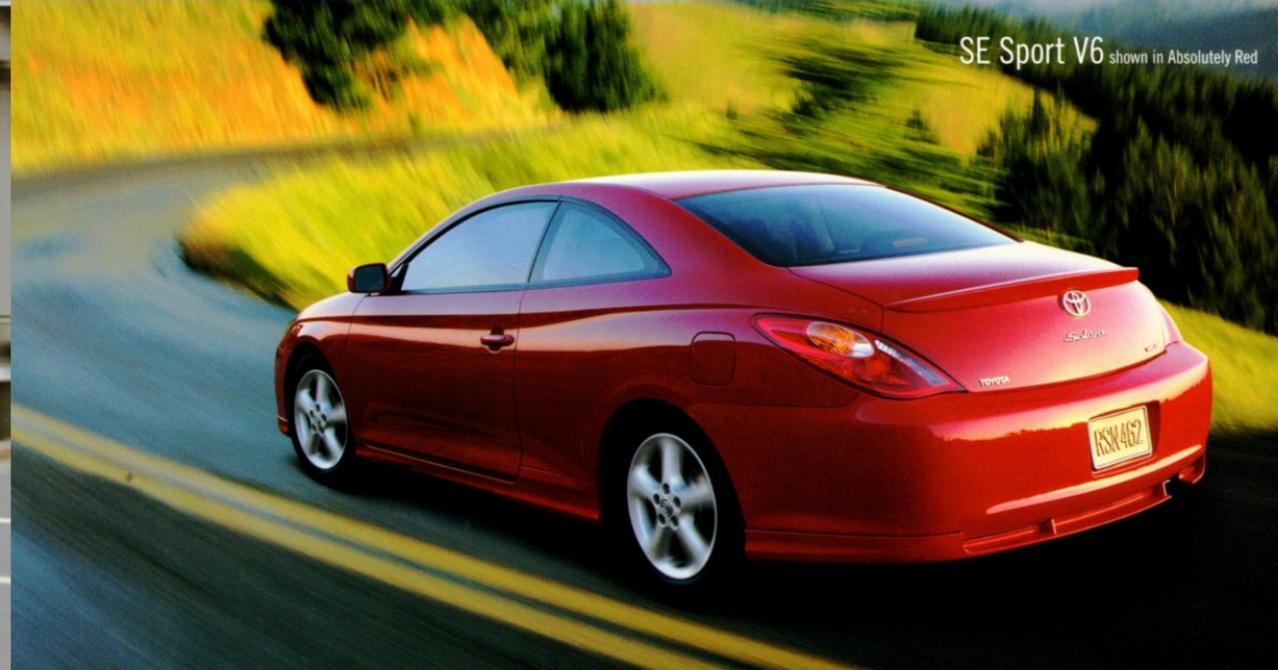
SE Sport V6 shown in Absolutely Red