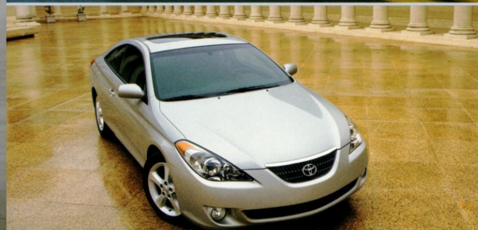
SLE V6 shown in Lunar Mist Metallic