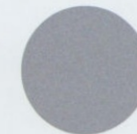
Cosmic Blue Metallic with Ivory, Dark Stone (SE, SLE) or Dark Charcoal (SE Sport) interior