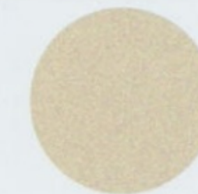
Lunar Mist Metallic with Dark Stone (SE, SLE) or Dark Charcoal (SE Sport) interior