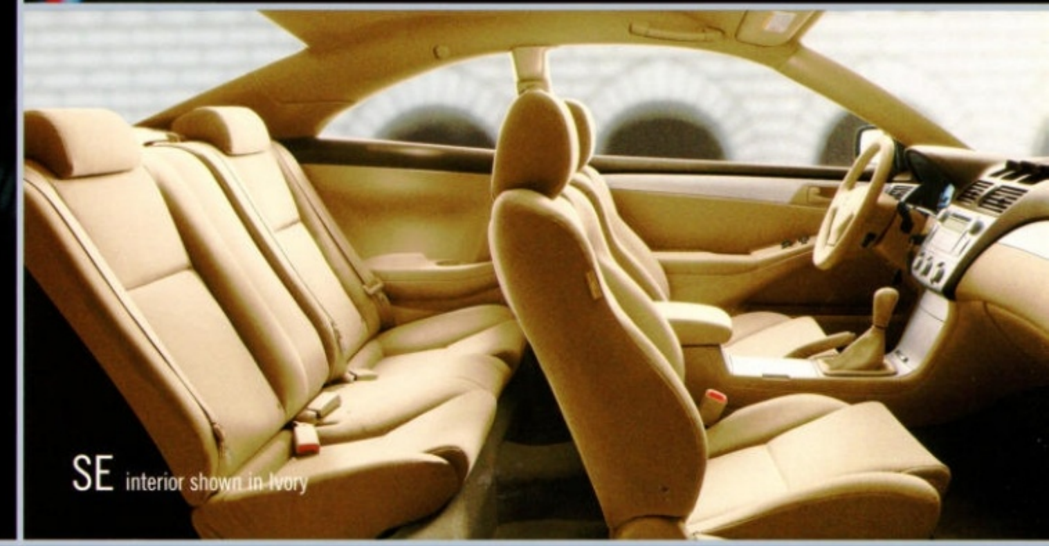
SE interior shown in Ivory