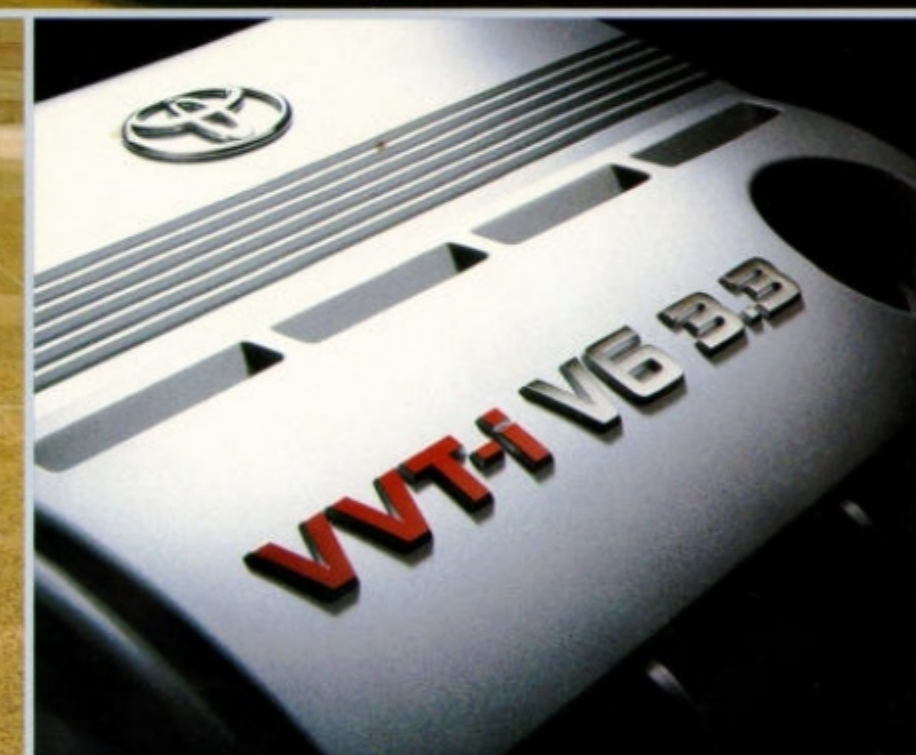
All-new 3.3-liter VVT-i V6.