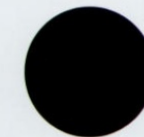
Black with Ivory, Dark Stone (SE, SLE) or Dark Charcoal (SE Sport) interior