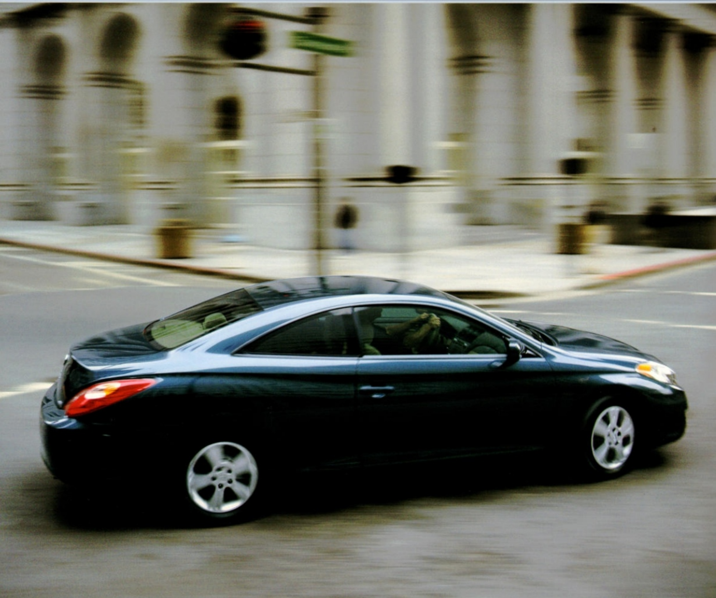
SE shown in Oceanus Pearl