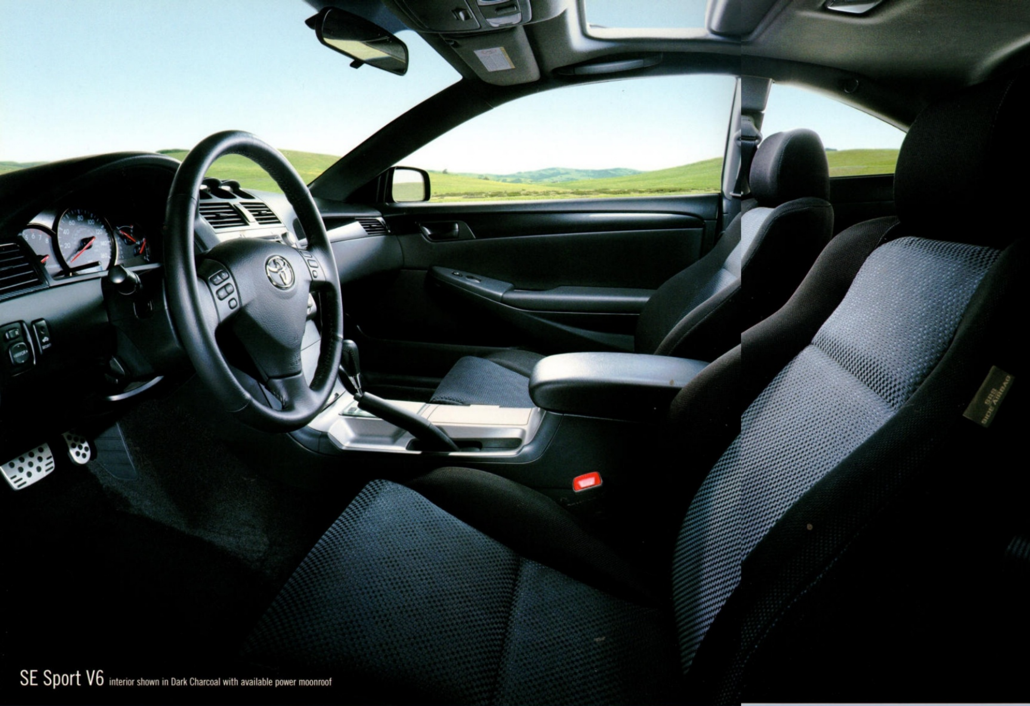
SE Sport V6 interior shown in Dark Charcoal with available power moonroof