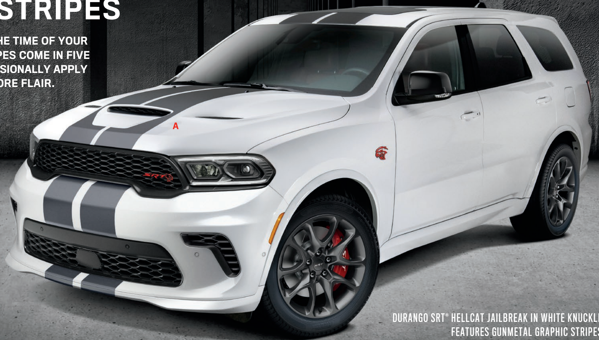
DURANGO SRT® HELLCAT JAILBREAK IN WHITE KNUCKLE FEATURES GUNMETAL GRAPHIC STRIPES