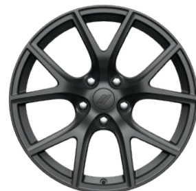
20x10-inch Forged Y-spoke Lights Out // (WSL) Available with Tow N Go + Blacktop Package or Tow N Go + Blacktop Redline Package