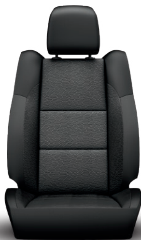
Carolina Mesh/Shift (Standard in Black)