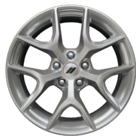
20x8-inch Satin Carbon Split 5-spoke // (WSK) Standard