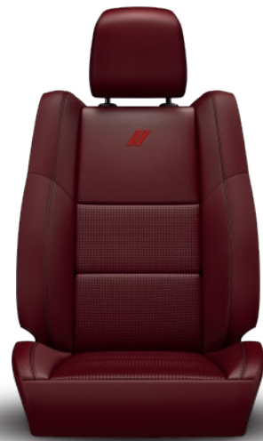
Nappa Leather trim with Nappa Axis II perforated inserts and Ruby Red accent stitching (Available in Black/Ebony Red)