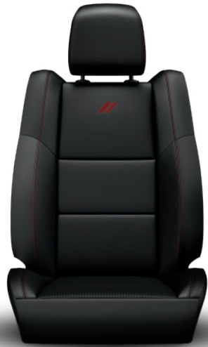
Nappa Leather trim with Nappa Axis II perforated inserts and Ruby Red accent stitching (Standard in Black)