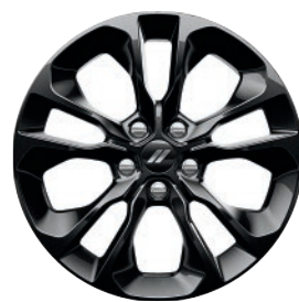
20x8-inch Black Noise // (WH4) Available on SXT and GT with Blacktop Package