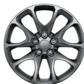
20x10-inch SRT Satin Carbon // (WP8) Available with Tow N Go Package