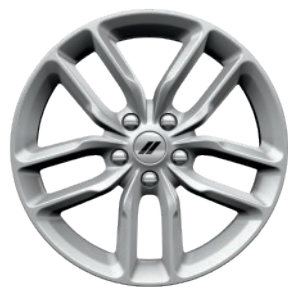
20x8-inch Fine Silver // (WHJ) Standard on GT