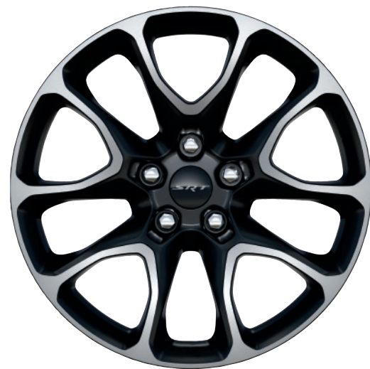
20x10-inch SRT Machined-Face with Dark pockets // (WHG) Standard