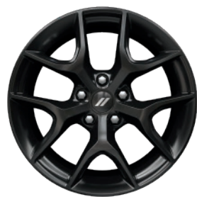
20x8-inch Black Noise // (WST) Available with Blacktop or Blacktop Redline Package