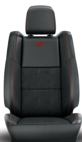
Leather and Alcantara® SRT® Performance with Red accent stitching (Available in Black)