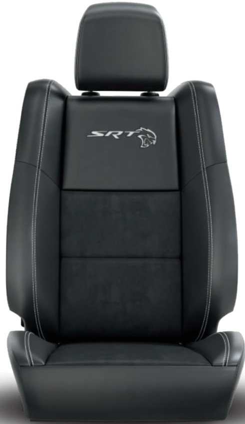
SRT® Laguna Leather and Alcantara® Suede with Silver SRT Hellcat embroidered logo (Standard in Black)