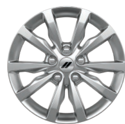
18-inch Painted Aluminum // (WP1) Standard on SXT