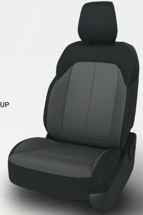
Soul and Soulmate Cloth Seats with Light Tungsten Accent Stitching – Global Black (Standard)