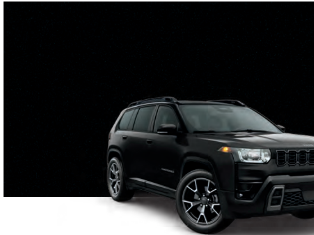
Diamond Black Crystal Pearl