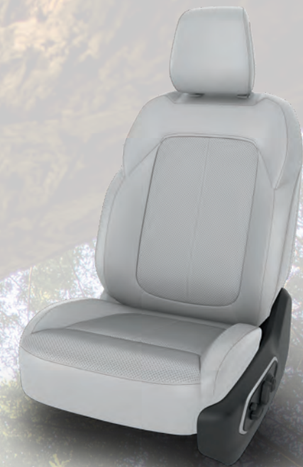
Capri Leatherette and Axis II Perforated Seats with Cognac Accent Stitching – Global Black / Arctic (Standard)