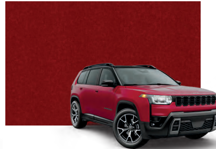
Red Hot Pearl