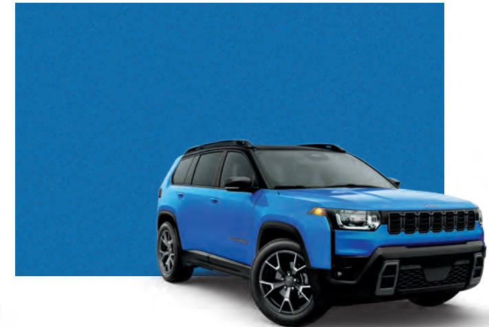
Hydro Blue Pearl