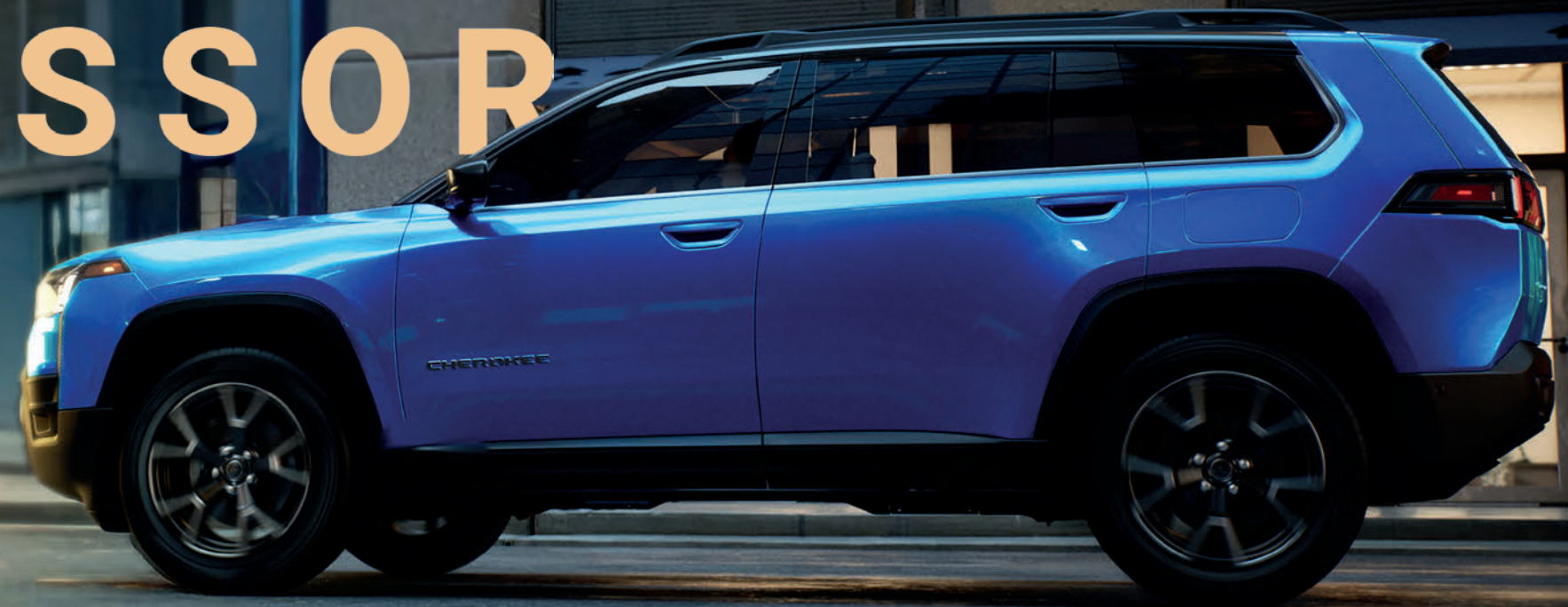
OVERLAND® IN HYDRO BLUE PEARL

HEROIC ROLE MODELS Bold living starts with the 2026 Jeep® Cherokee, which has the capability to generate unwavering confidence in almost any situation. Driving it all is the Cherokee 1.6L I-4 EP Turbo Hybrid Electric Vehicle engine paired with an Electronically Controlled Continuously Variable Transmission (eCVT). It delivers 210 horsepower, 230 lb-ft of torque and an Unsurpassed Hybrid Towing Capacity of up to 1,587 kg (3,500 lb). 2 With its Jeep Active Drive I Four-Wheel Drive (4WD) System, approach angle of 19.1 degrees and Best-in-Class Departure Angle, 1 Cherokee will get you in – and out of – uncharted territory. Along the way, the Selec-Terrain® Traction Management System lets you easily toggle between ideal settings for Sport, Auto, Snow and Sand/Mud conditions. In all, Cherokee possesses an extraordinary skill set that will inspire your most daring adventures.