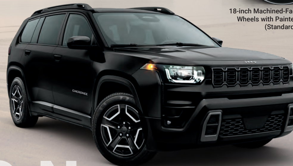
Laredo in Diamond Black Crystal Pearl