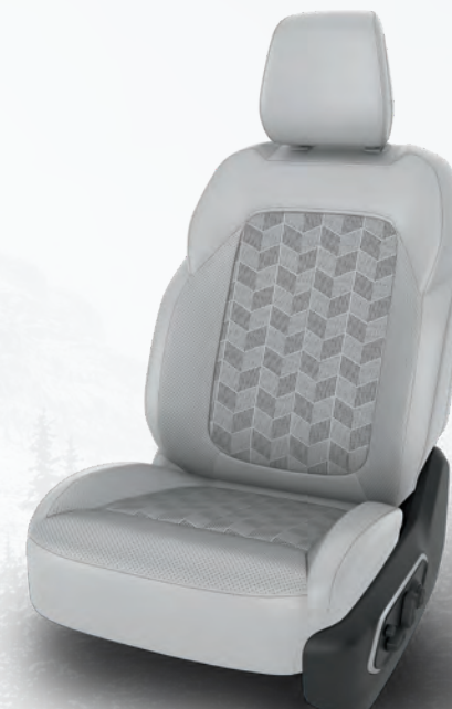
Capri Leatherette Seats with Axis II and Apex Perforations with Cognac Accent Stitching – Global Black /Arctic (Standard)