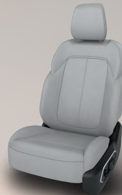
Soul and Soulmate Cloth with Labrinth Embossed Seats and Light Tungsten Accent Stitching – Global Black / Arctic (Standard)