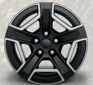
18-inch Machined-Face Aluminum Wheels with Painted Pockets (Standard)