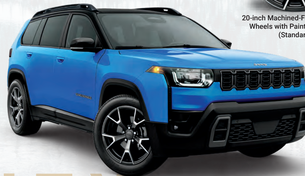
Overland® in Hydro Blue Pearl