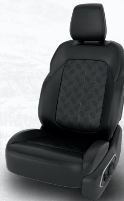
Capri Leatherette Seats with Axis II and Apex Perforations with Cognac Accent Stitching – Global Black (Standard)