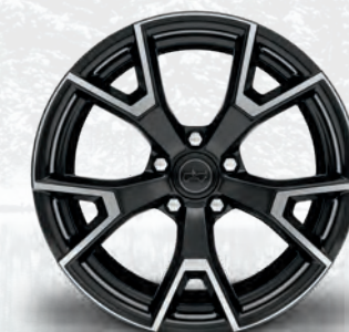
20-inch Machined-Face Aluminum Wheels with Painted Pockets (Standard)