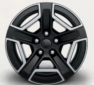
18-inch Machined-Face Aluminum Wheels with Painted Pockets (Standard)