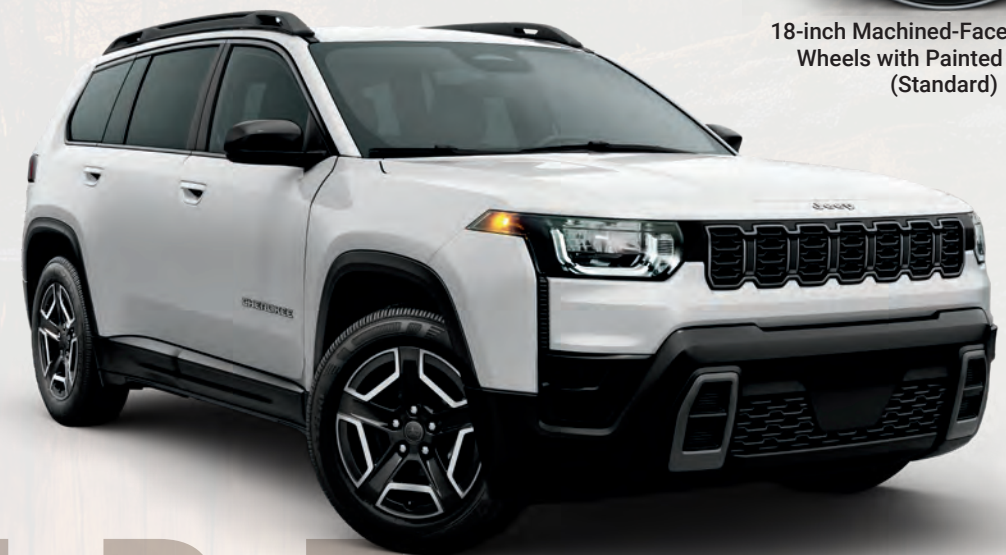
Cherokee in Bright White