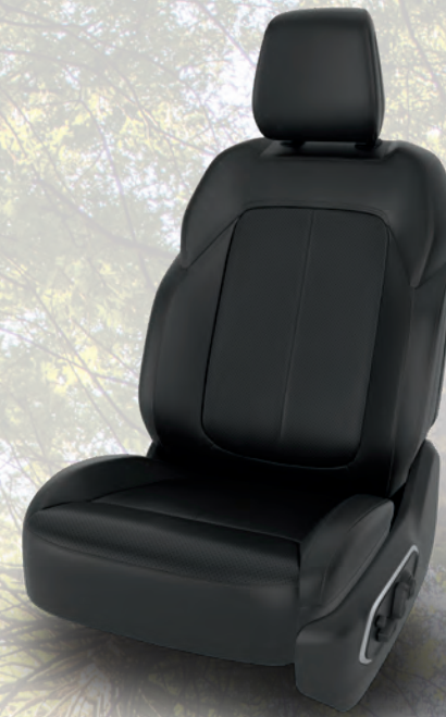
Capri Leatherette and Axis II Perforated Seats with Cognac Accent Stitching – Global Black (Standard)