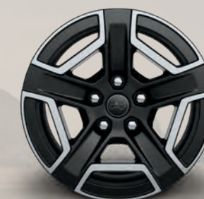
18-inch Machined-Face Aluminum Wheels with Painted Pockets (Standard)