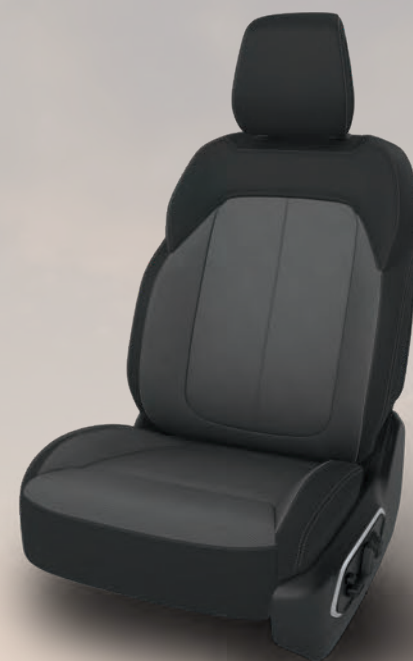
Soul and Soulmate Cloth with Labrinth Embossed Seats and Light Tungsten Accent Stitching – Global Black (Standard)