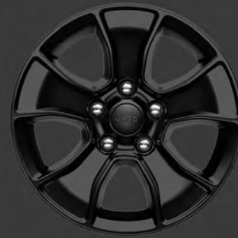
17-INCH BLACK OFF-ROAD WHEEL (10) [ 77073002AA ]