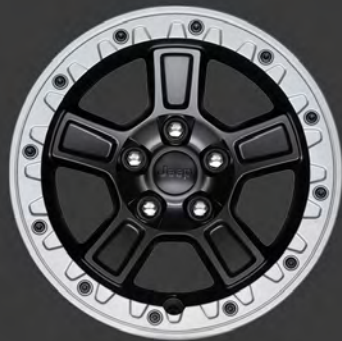
17-INCH 5-SPOKE BEADLOCK-CAPABLE WHEEL (10) [ 77072585AA ]