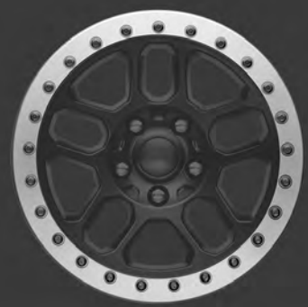
FUNCTIONAL BEADLOCK RING KIT (2)(6) Shown on 17-inch 10-Spoke Beadlock-Capable Wheel. [ P5160154AA ]