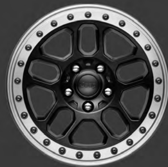
17-INCH 10-SPOKE BEADLOCK-CAPABLE WHEEL (10) [ 77073015AA ]