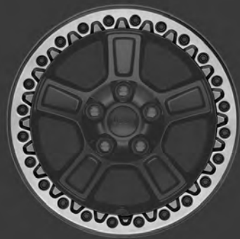
FUNCTIONAL BEADLOCK RING KIT (2)(11) Shown on 17-inch 5-Spoke Beadlock-Capable Wheel. [ 77072586AA - BFGoodrich® tire ]