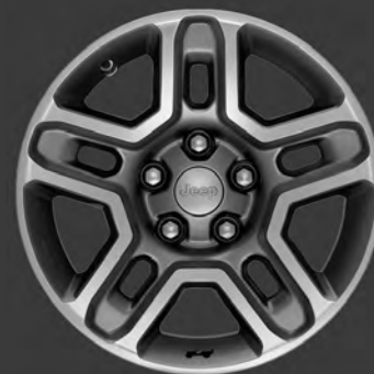
17-INCH SLOTTED OFF-ROAD WHEEL (10) [ 77072494AB ]