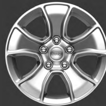
17-INCH SILVER OFF-ROAD WHEEL (10) [ 77072472AB ]