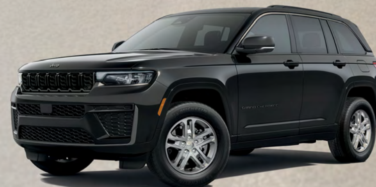
Laredo in Diamond Black Crystal Pearl