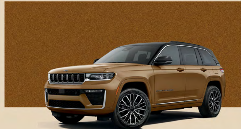
Copper Shino Metallic