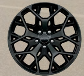
21-inch fully painted High-Gloss Black Noise aluminum wheels (Included with Obsidian Package)