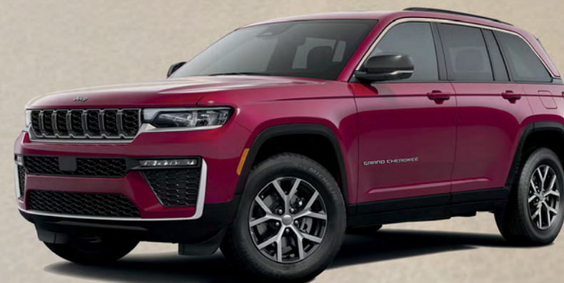
Limited in Velvet Red Pearl