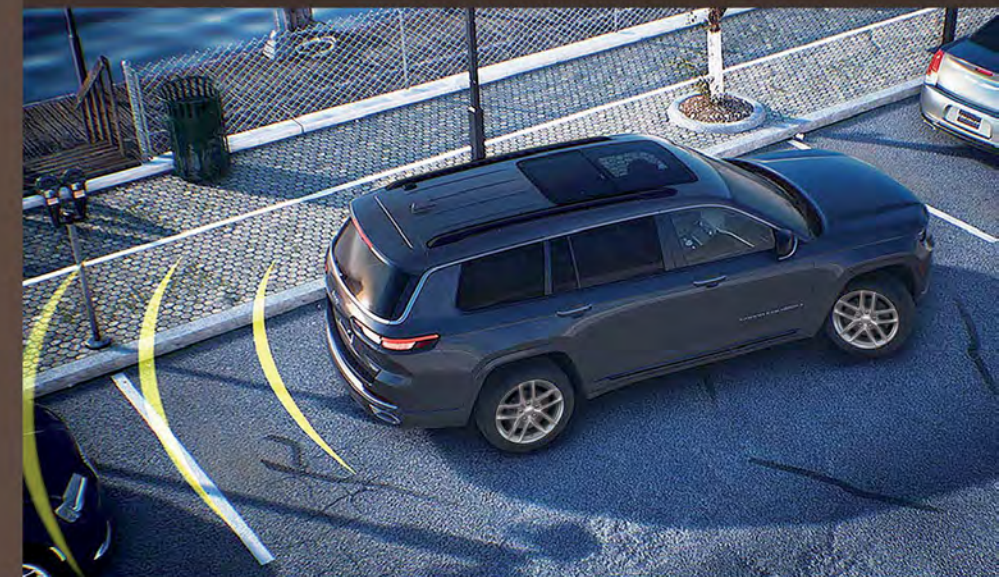
PARALLEL AND PERPENDICULAR PARK ASSIST 3*