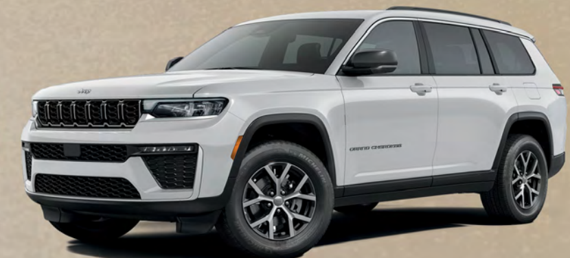
3-Row Limited in Bright White