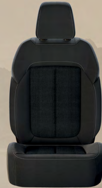
Origin and Essence Cloth seats with Light Tungsten accent stitching – Global Black (Standard)