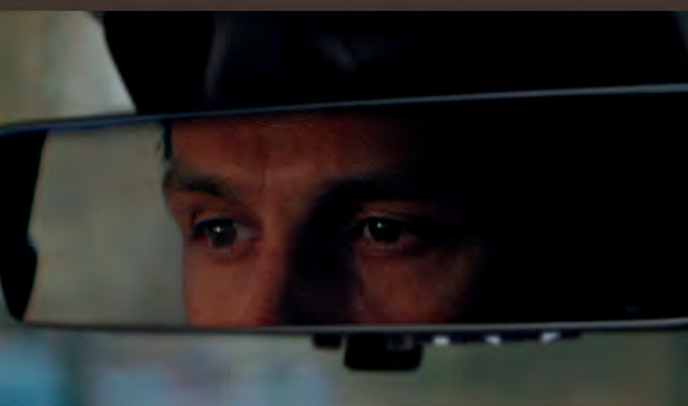
DROWSY-DRIVER DETECTION 3