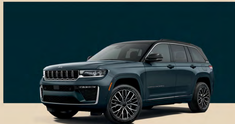
Fathom Blue Pearl