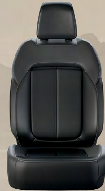
Nappa Leather-Faced and Axis II Perforated seats with Light Tungsten accent stitching – Global Black (Standard)