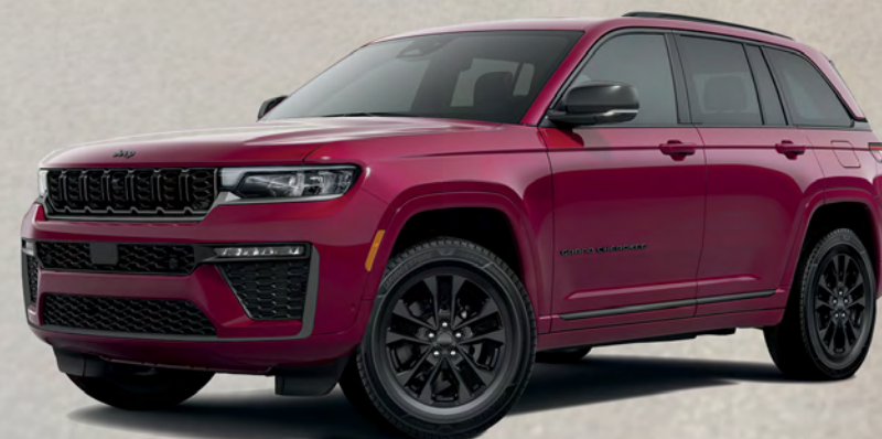
Limited Reserve in Velvet Red Pearl