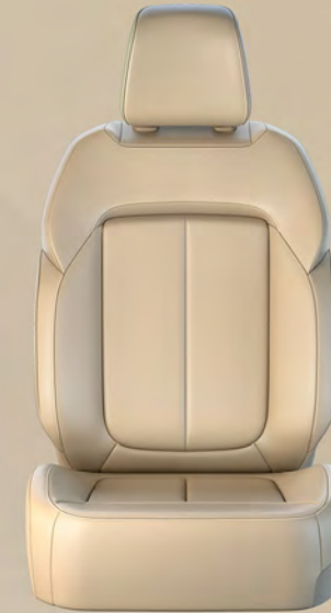
Capri Leatherette seats with Light Tungsten accent stitching – Global Black / Wicker Beige (Standard)