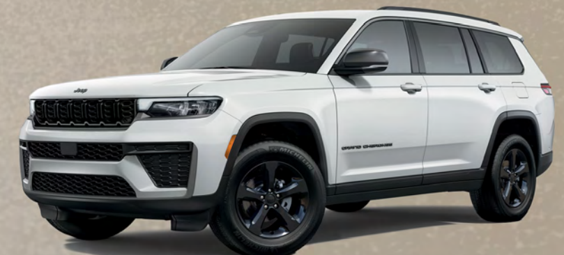
3-Row Laredo Altitude in Bright White