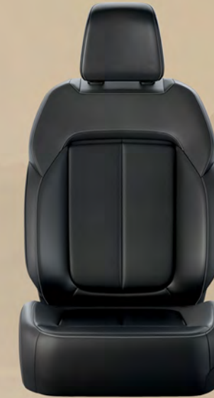
Capri Leatherette and Axis II Perforated seats with Light Tungsten accent stitching – Global Black (Included with Luxury Tech Group II)