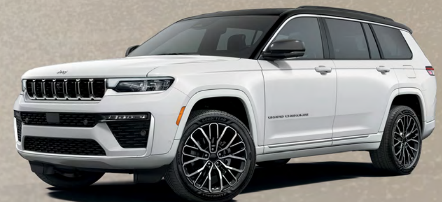
3-Row Summit in Bright White