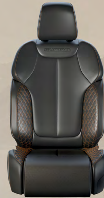
Ventilated Palermo Leather-Faced seats with Quilted Palermo Leather Bolsters, Cognac accent stitching, Steel Grey piping and embossed Summit logo – Global Black (Standard)