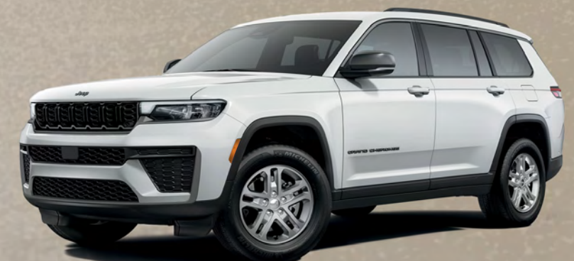
3-Row Laredo in Bright White