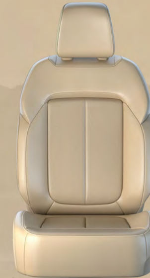
Capri Leatherette and Axis II Perforated seats with Light Tungsten accent stitching – Global Black / Wicker Beige (Included with Luxury Tech Group II)