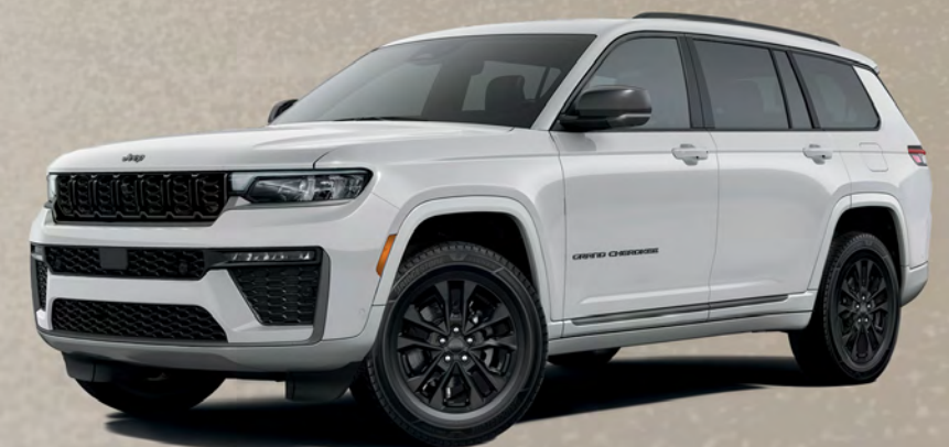
3-row Limited Reserve in Bright White