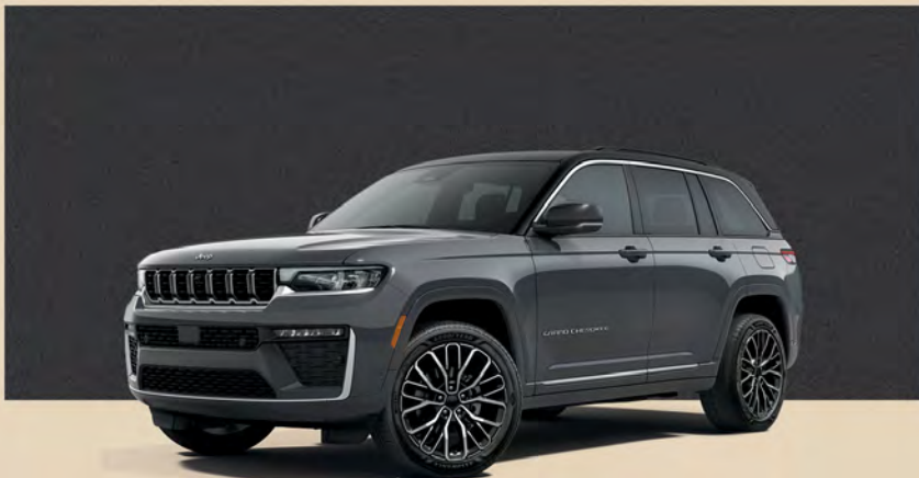
Baltic Grey Metallic