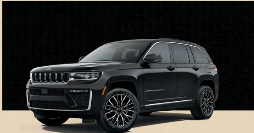
Diamond Black Crystal Pearl