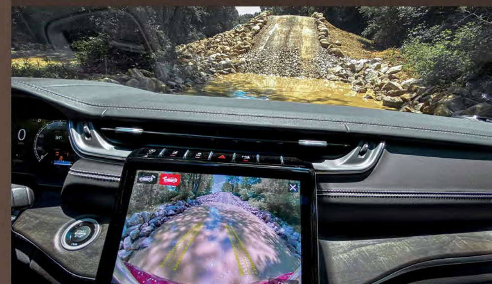
INTEGRATED OFF-ROAD CAMERA 3*