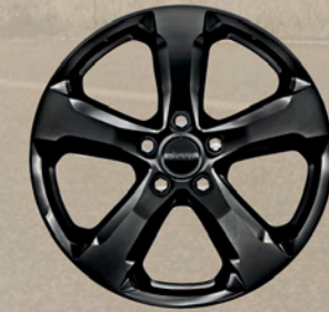
20-inch Gloss Black-painted aluminum wheels (Standard)