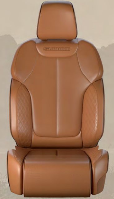
Ventilated Palermo Leather-Faced seats with Quilted Palermo Leather Bolsters, Cognac accent stitching, Global Black piping and embossed Summit logo – Tupelo / Black (Standard)