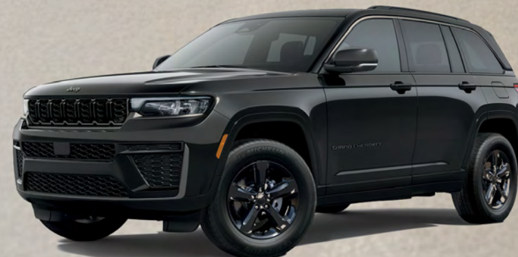
Laredo Altitude in Diamond Black Crystal Pearl