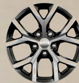
18-inch polished aluminum wheels with High-Gloss Black pockets (Standard)