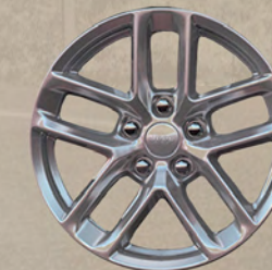
18-inch Fine Silver fully painted aluminum wheels (Standard)