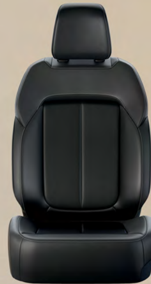
Capri Leatherette seats with Light Tungsten accent stitching – Global Black (Standard)