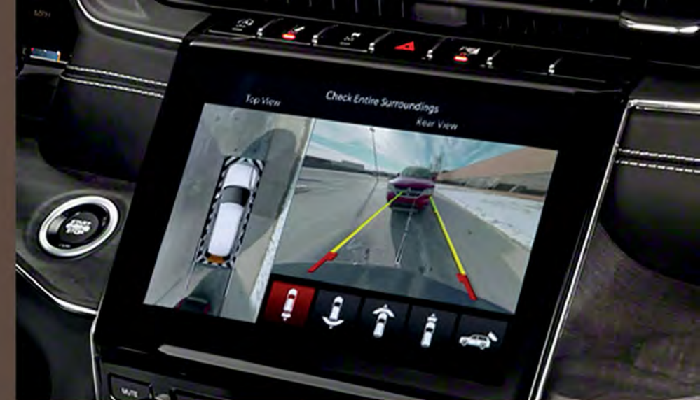
360° SURROUND-VIEW CAMERA SYSTEM 5