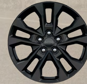
20-inch High-Gloss Black Noise-painted aluminum wheels (Standard)