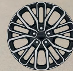
21-inch machined-face aluminum wheels with High-Gloss Black Noise pockets (Standard)