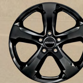
20-inch Gloss Black-painted aluminum wheels (Included with Limited Altitude Package)