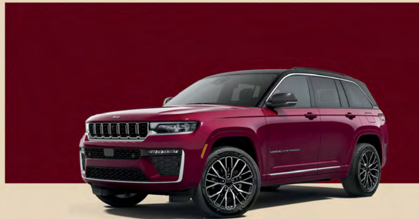
Velvet Red Pearl