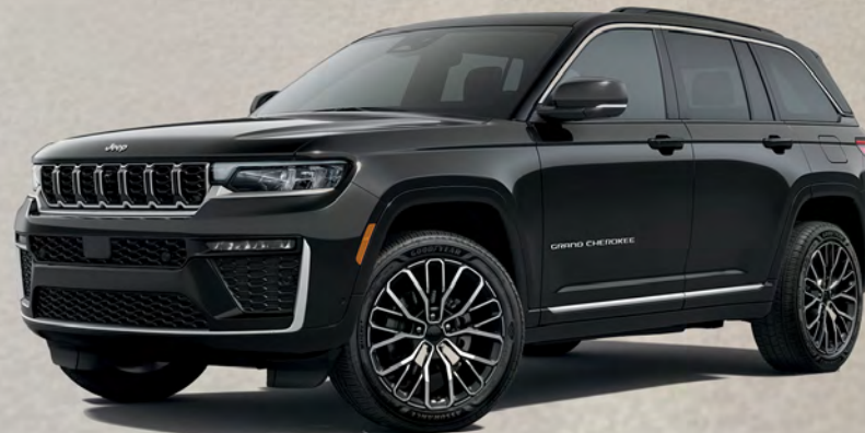
Summit in Diamond Black Crystal Pearl