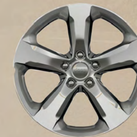
20-inch machined-face aluminum wheels with High-Gloss Tech Grey pockets (Available)