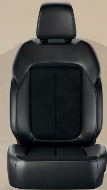
Capri Leatherette and Axis II Perforated Suede seats with Light Tungsten accent stitching – Global Black (Standard)