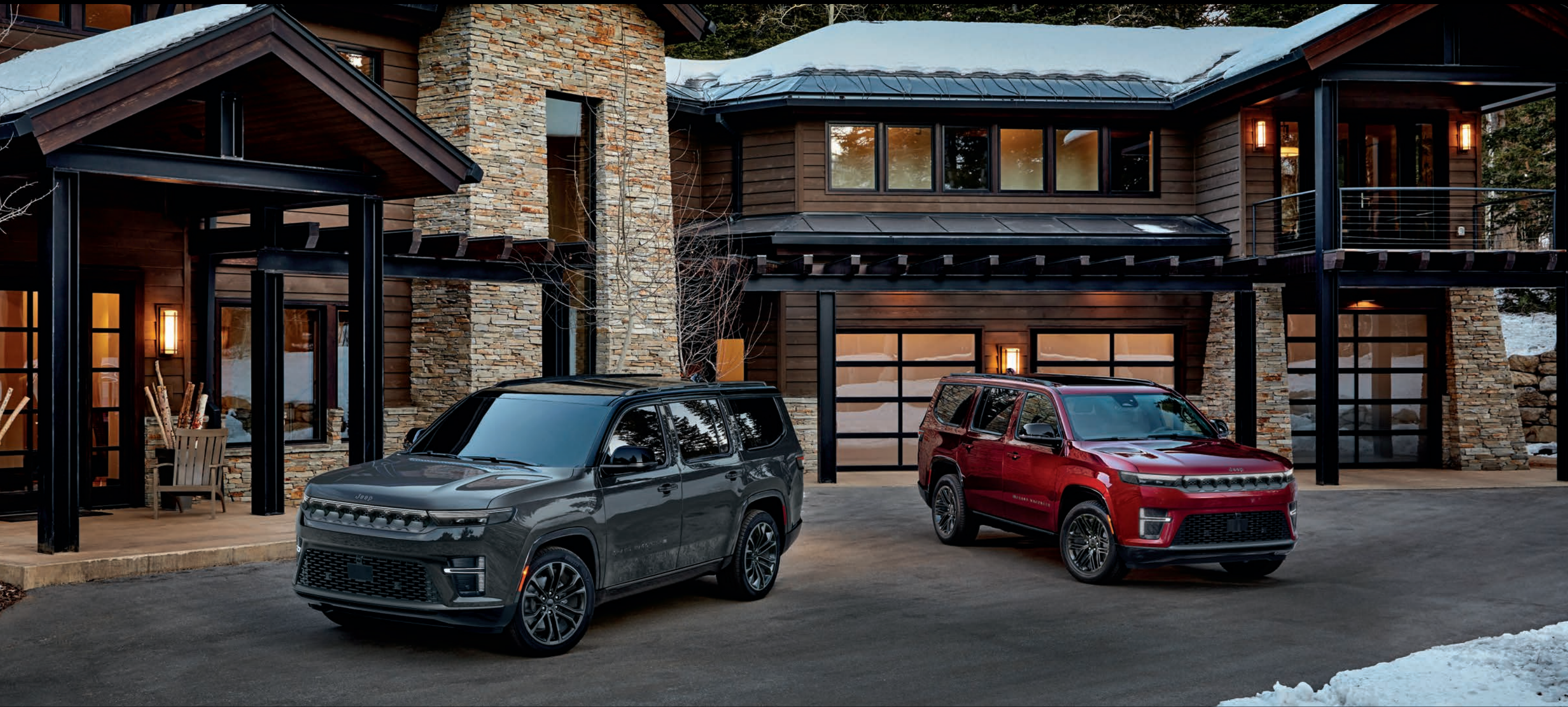
ON LEFT Grand Wagoneer Summit Reserve with Black Appearance Package in Baltic Grey Metallic