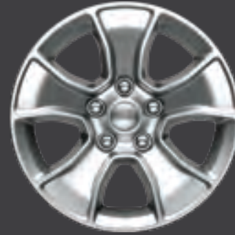
17-INCH SILVER OFF-ROAD WHEEL (9) [ 77072472AB ]