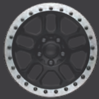
FUNCTIONAL BEADLOCK RING KIT (2)(6) Shown on 17-inch 10-Spoke Beadlock-Capable Wheel. [ P5160154AA ]