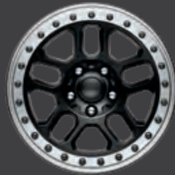
17-INCH 10-SPOKE BEADLOCK-CAPABLE WHEEL (9) [ 77073015AA ]