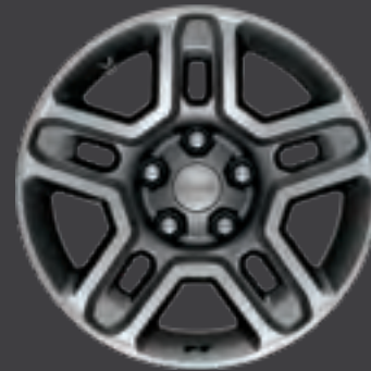
17-INCH SLOTTED OFF-ROAD WHEEL (9) [ 77072494AB ]