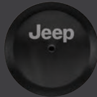
[ 82215434AB - 32-inch ] [ 82215708AB - 33-inch ]