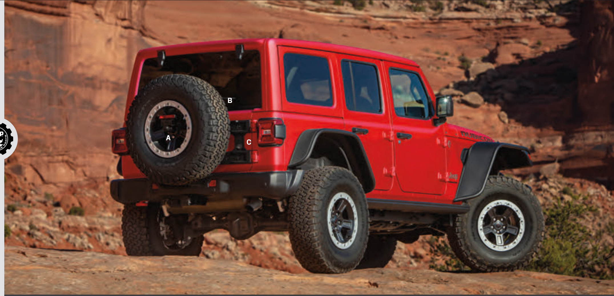
JEEP® WRANGLER RUBICON® IN FIRECRACKER RED FEATURES JEEP® PERFORMANCE PARTS HIGH-TOP STEEL FENDERS, CENTRE HIGH-MOUNT STOP LIGHT (CHMSL) RELOCATION KIT, OVERSIZED SPARE TIRE MODIFICATION KIT, TAILGATE REINFORCEMENT SYSTEM, JEEP PERFORMANCE PARTS ROCK RAILS, JEEP BRAND HITCH RECEIVER COVER AND JEEP PERFORMANCE PARTS 37-INCH TIRE-READY LIFT KIT (INCLUDING 17-INCH 5-SPOKE BEADLOCK-CAPABLE WHEELS)

C. TAILGATE REINFORCEMENT SYSTEM. Allows for larger tires to be mounted on the swing gate. Reinforcement is powder-coated black and works with production hinge for easier installation. Must be used with the Oversized Spare Tire Modification Kit, sold separately. [ 82215356AC ]