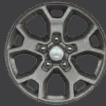
17-INCH PRODUCTION RUBICON ® WHEEL WITH UNIQUE SATIN CARBON FINISH (9) [ 82215802 ]