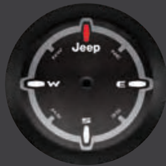
[ 82215446AB ]

Personalize and protect! Mopar® offers a variety of themed designs for your Jeep® Wrangler Spare Tire Cover.