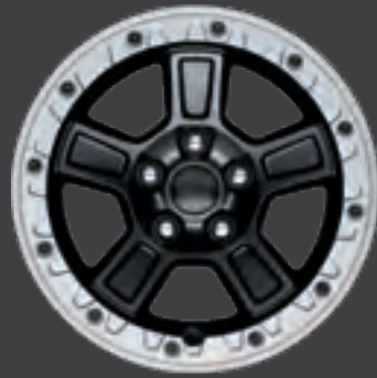
17-INCH 5-SPOKE BEADLOCK-CAPABLE WHEEL (9) [ 77072585AA ]