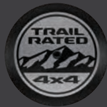
[ 82215438AB ]