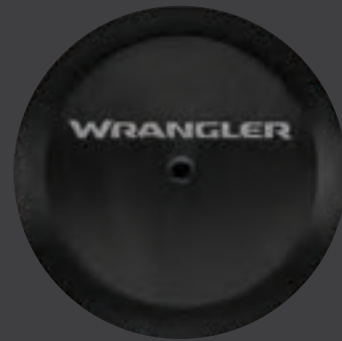
[ 82215444AB ]