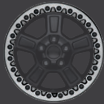
FUNCTIONAL BEADLOCK RING KIT (2)(10) Shown on 17-inch 5-Spoke Beadlock-Capable Wheel. [ 77072586AA - BFGoodrich ® tire ]